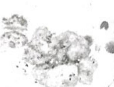
Salt & Pepper Fish