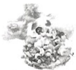
Cashew Nut Chicken