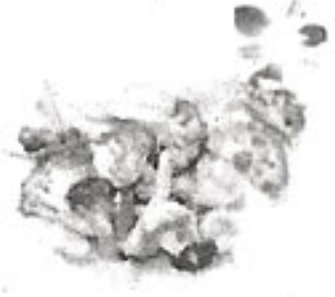
Shrimp with Broccoli