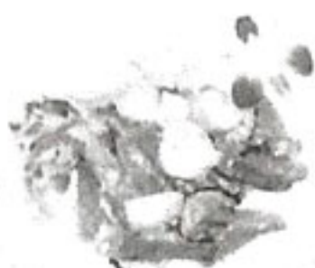
Scallop Chinese Peas